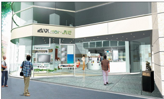
Artist's image of NIPPER'S GINZA showroom

* See the website for details in Japanese: http://www.jvc-victor.co.jp/28s/