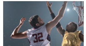
24x Dynamic Zoom in HD Zoom

Dynamic Zoom combines Optical Zoom plus Pixel Mapping—focusing on a smaller image area for lossless 24X Zoom