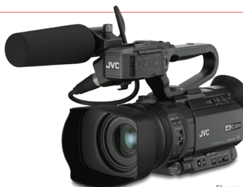
Shown with optional microphone