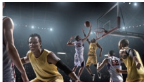
Original Image No Zoom

The ultra high quality imagery begins with a precision 12x F1.2–3.5 optical zoom lens (35mm equivalent: 29.6–355mm). When shooting in the HD mode, Dynamic Zoom combines optical zoom and pixel mapping from a 4K image sensor to create seamless and lossless 24x zoom. This allows the camera to have a long zoom range while retaining its compact form factor.