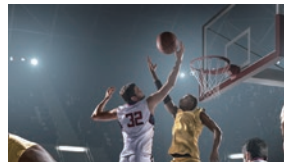
12x Optical Zoom